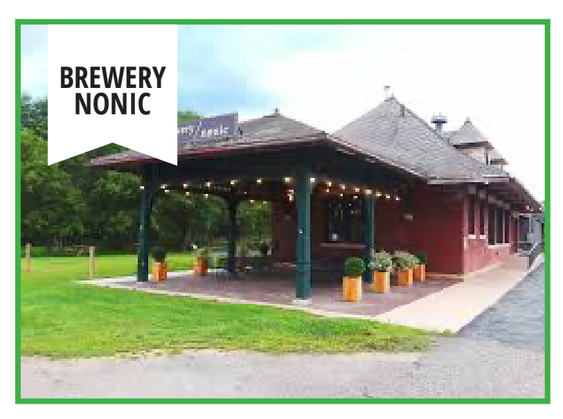
MORNING \\ GOURMET SUNDAY BRUNCH WITH CHEF STACY