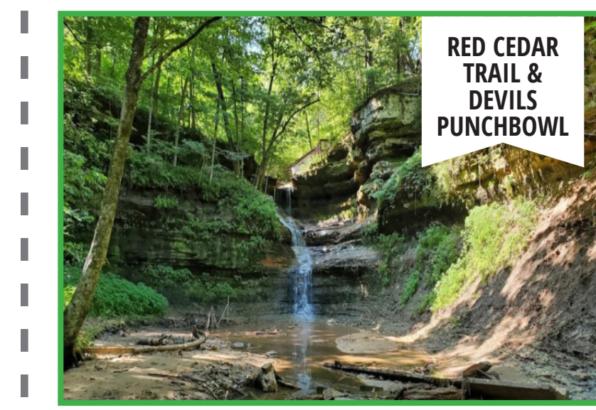
START THE DAY WITH A MORNING HIKE DOWN THE RED CEDAR TRAIL OR HEAD OVER TO THE DEVILS PUNCHBOWL