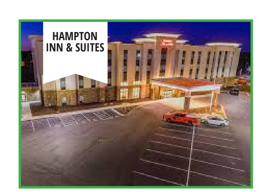
WHERE TO STAY \\ REST UP FOR LONGER DRIVES FOR ARTS AND HERITAGE DAY!