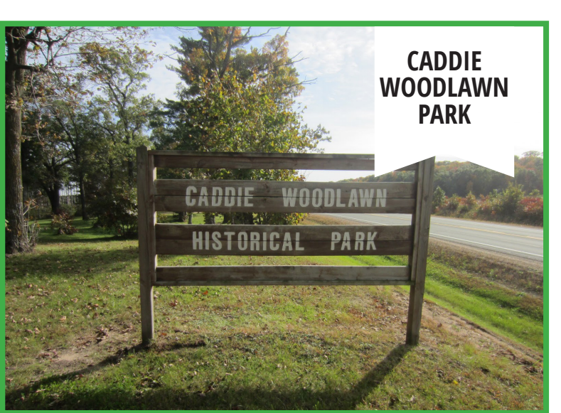
MORNING \\ VISIT DUNN COUNTY'S FAVORITE CHIL-DREN'S BOOK CHARACTER AND HER FAMILIES UPBRINGING