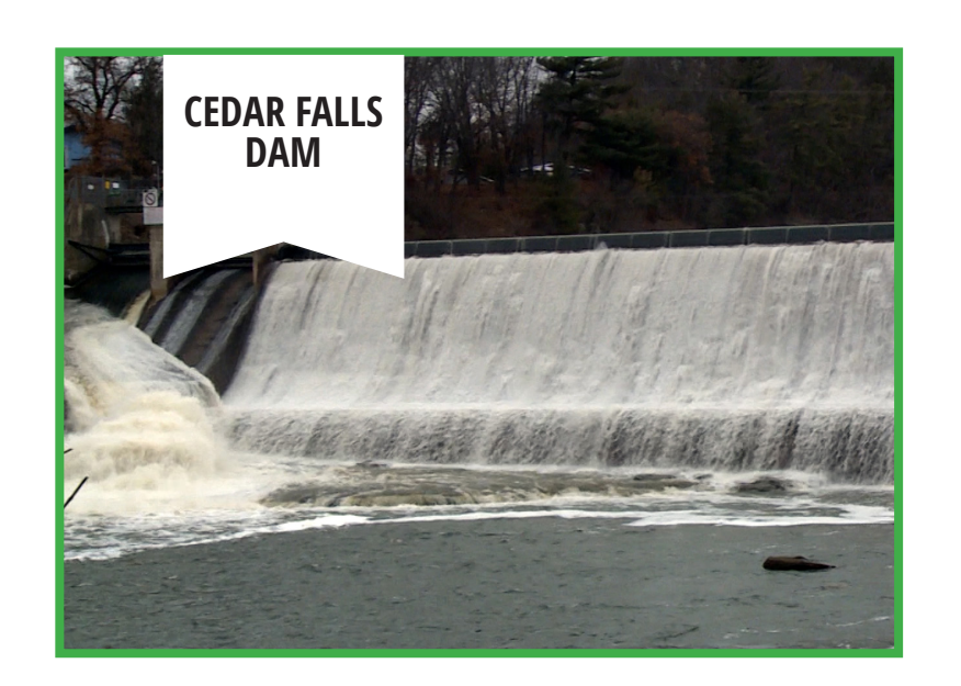
RELAX \\ VISIT THE HISTORIC CEDAR FALLS DAM FOR A RELAXING WALK TO END YOUR DAY.