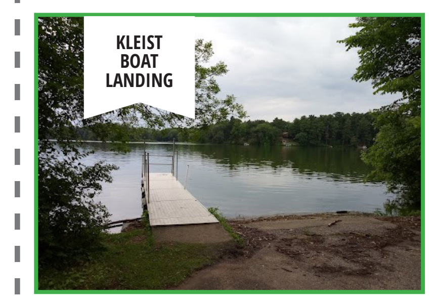
WATER ADVENTURE \\ DROP YOUR BOAT AND GET READY FOR A BEAUTIFUL DAY ON THE WATER