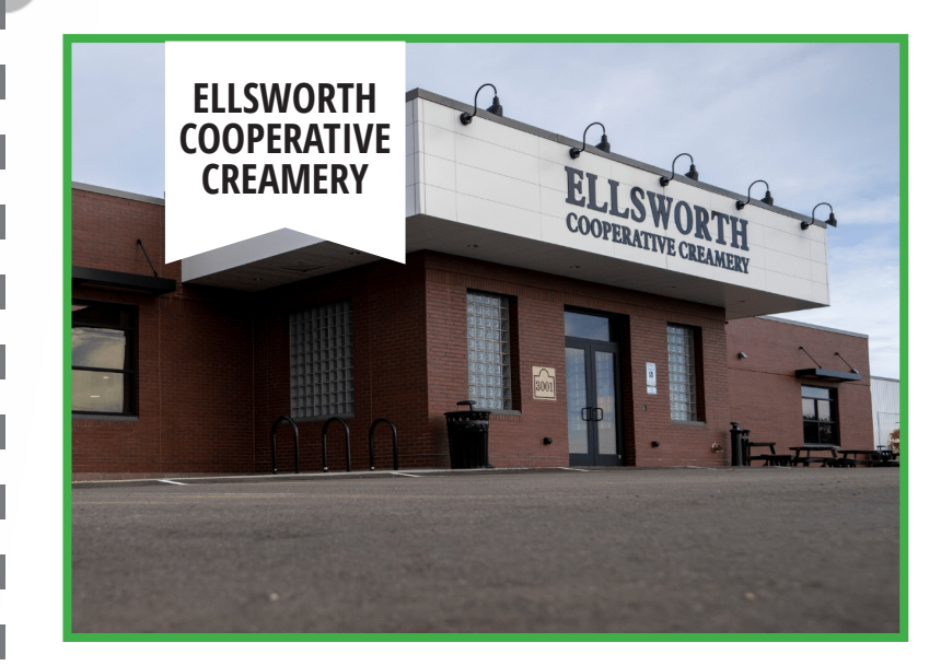
SWEET TREAT \\ STOCK UP ON LOCAL SNACKS AND ENJOY ICE CREAM ON THE PATIO OR BACK ON THE ROAD