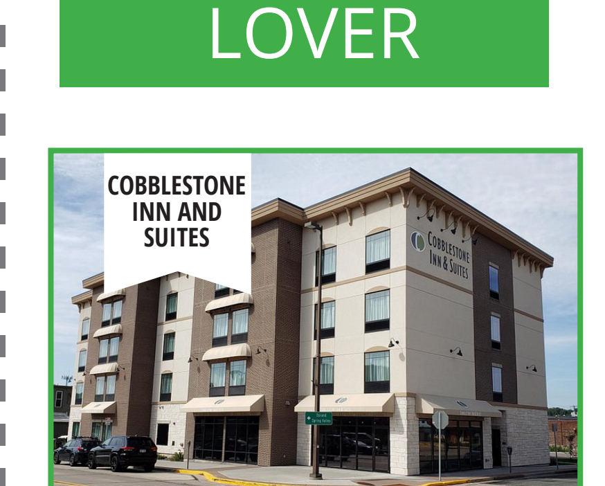
WHERE TO STAY \\ CONVENIENTLY LOCATED RIGHT IN DOWNTOWN MENOMONIE