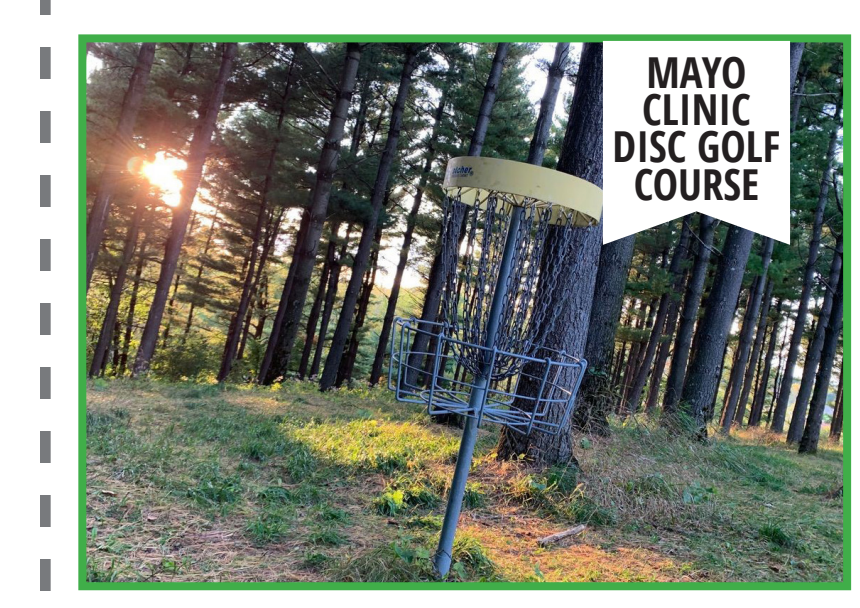
EVENING \\ A SCENIC DISC GOLF COURSE LOCATED BEHIND THE MENOMONIE MIDDLE SCHOOL.

EVENING \\ CATCH THE LUDINGTON GUARD BAND PERFORMANCE OR STOP ON A WEDNESDAY OR SATURDAY TO ENJOY THE LOCAL FARMERS MAR-KET.