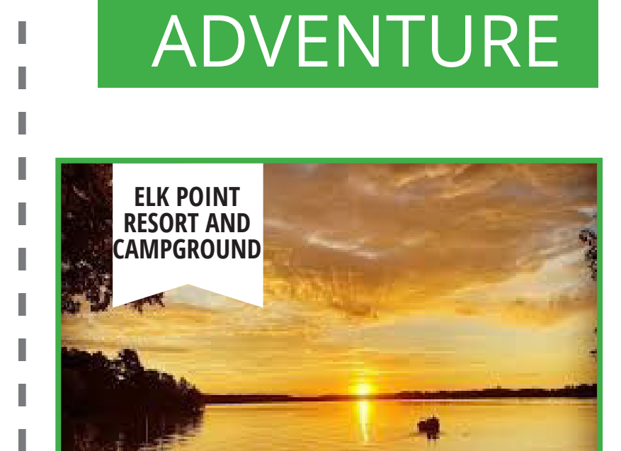
WHERE TO STAY \\ PULL YOUR CAMPER OR PITCH YOUR TENT AND STAY AT THIS GREAT CAMP-GROUND RIGHT ON TAINTER LAKE.