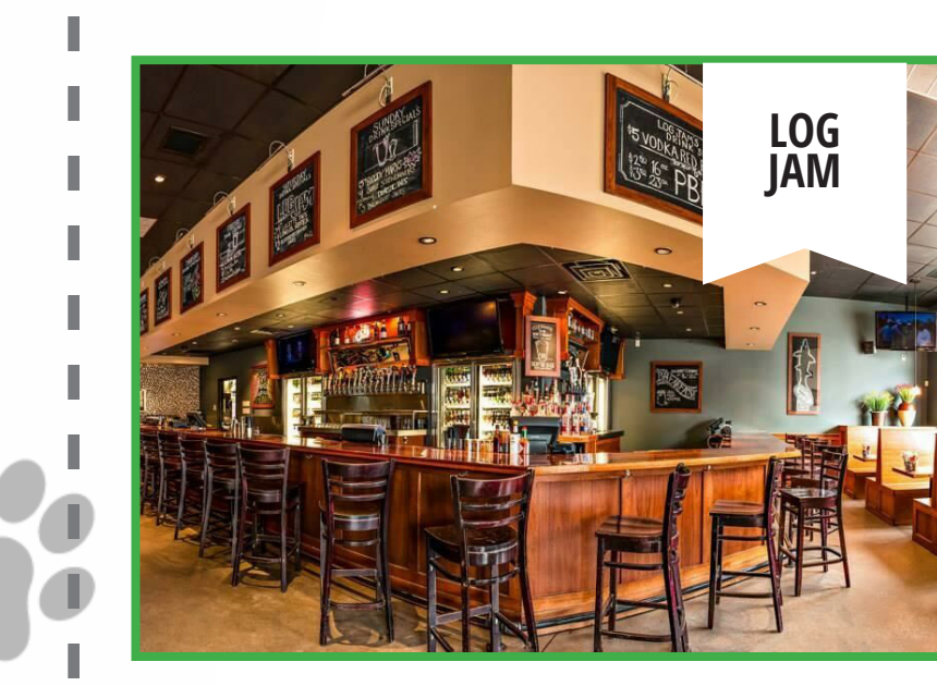
EVENING \\ HAVE A CLASSIC WISCONSIN FISH FRY AND MADE-FROM-SCRATCH SOUP OF THE DAY!