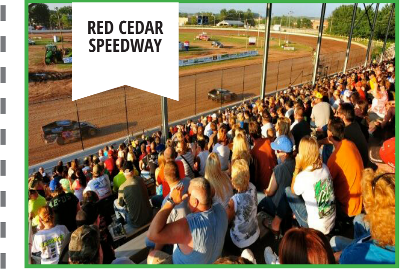
LOCAL FUN\\ A DIRT TRACK, COVERED GRAN-STANDS, AND 6 CLASSES OF RACE CARS. COME EXPERIENCE WHAT HAS BEEN ONE OF MENOM- ONIES FAVORITE SOURCES OF ENTERTAINMENT FOR OVER 50 YEARS.